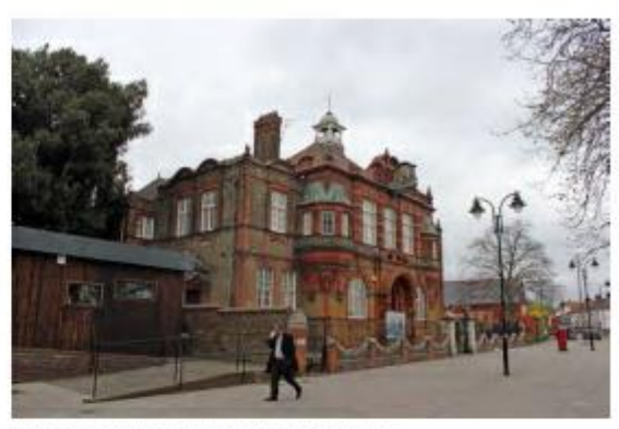
View looking north-east towards the south elevation.