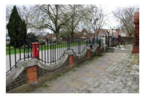
Detail of the boundary wall and railings - included within the listing