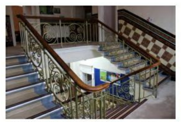
View on the half landing of the original main staircase