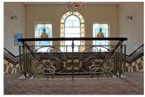
View looking north towards the stained-glass window over the main staircase