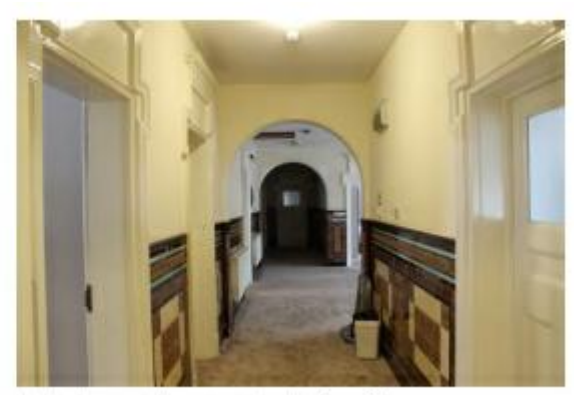
View looking west in the east corridor within Room FOI.