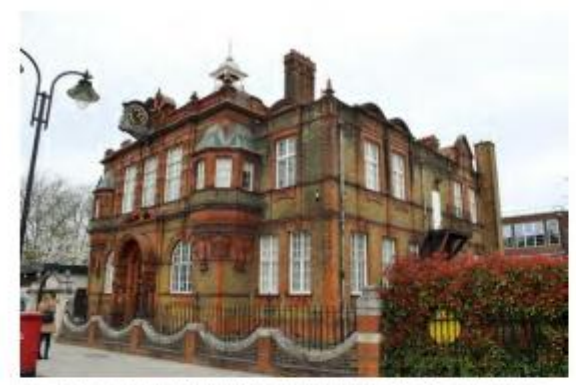
View looking north-west towards the south elevation of the former Education Offices: