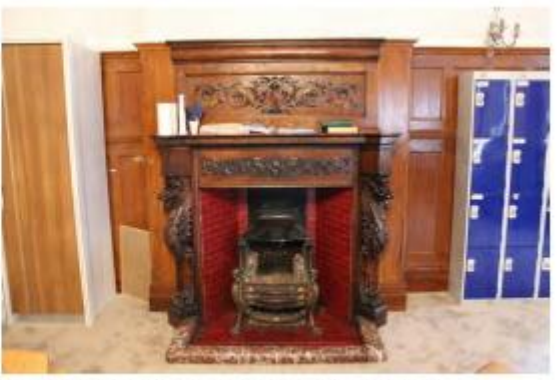
Detail of the original furplace in the conference hall (Roam FD4)