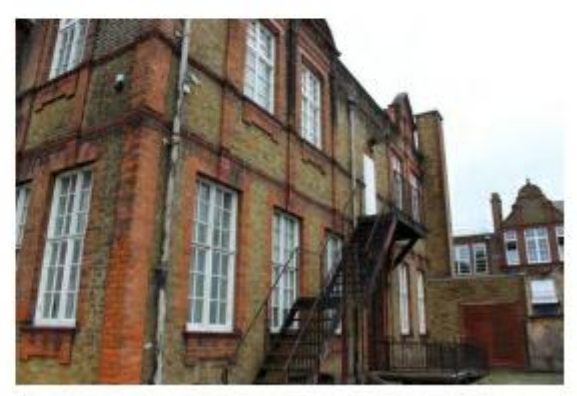
View of the east elevation. The fire escape stars and ramp are modern intrusive interventions