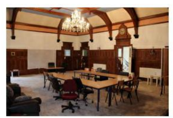
View looking north-west in the main conference hall (Room FD4).