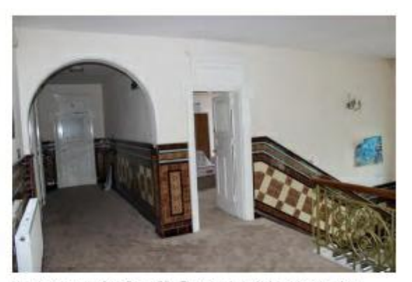
View looking west from Room FDI. The glazed tile dado and ornate door surrounds are continued at first floor level